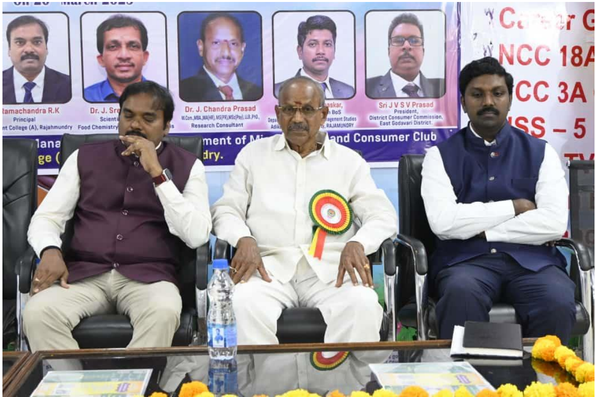
Falicitations to the guests and deligates