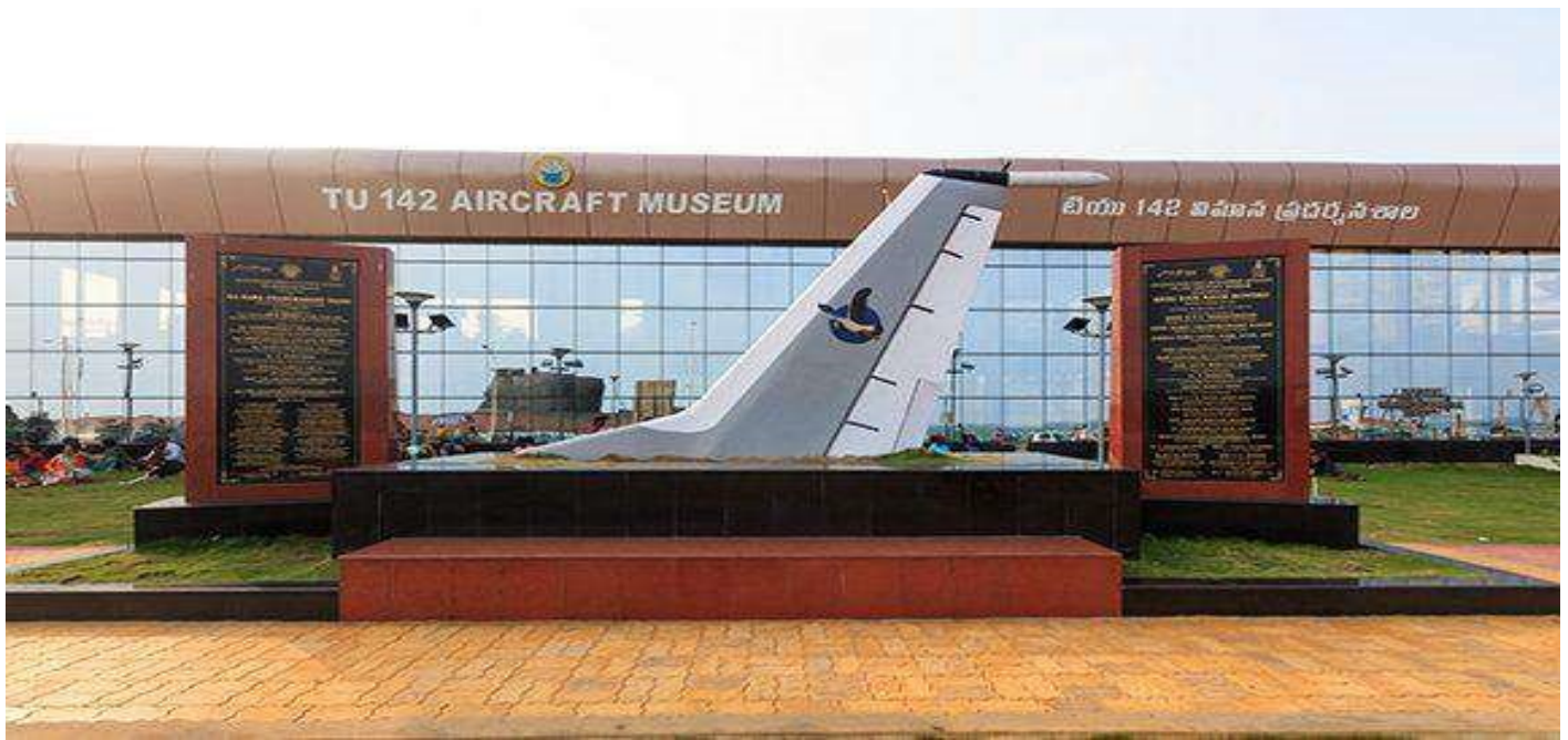
TU 142 Aircraft Museum, Kakinada — Tail Assembly Display at Museum Entrance

Visit to TU 142 Aircraft Museum & Kakinada Beach