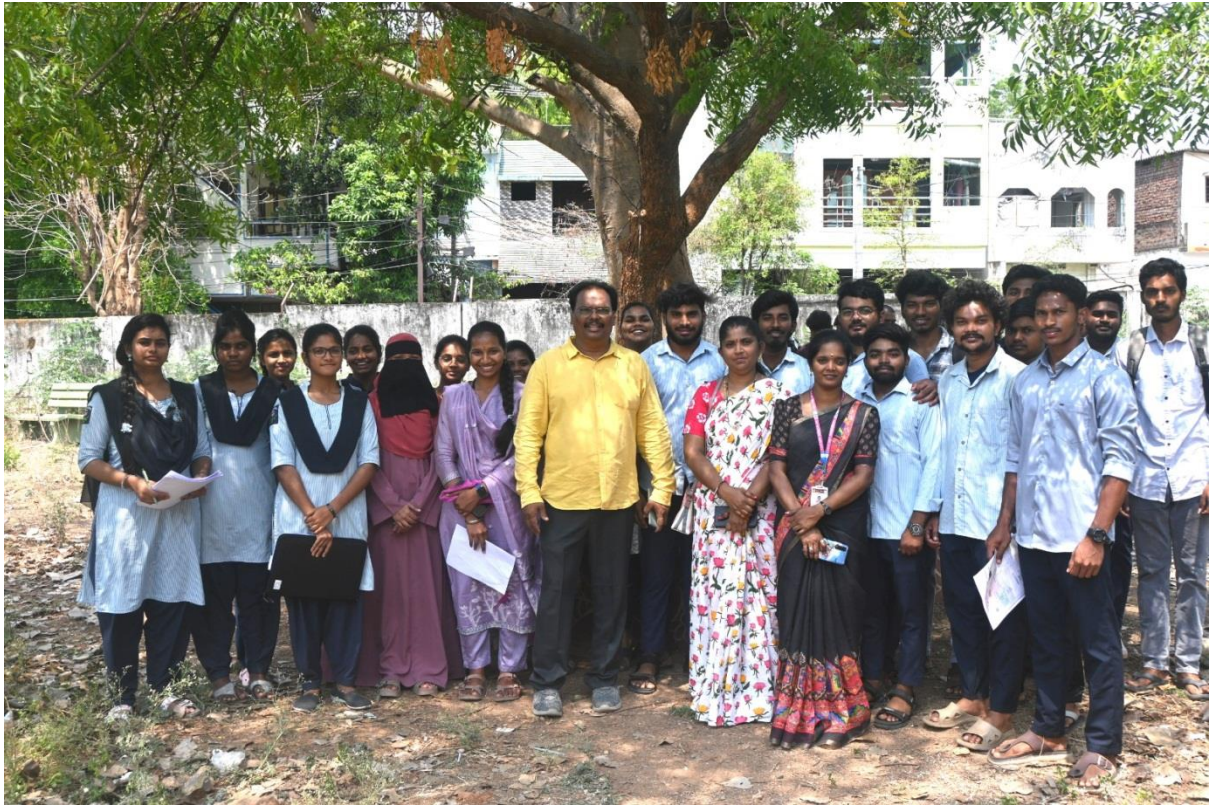
PARTICIPANTS FROM NRC-LEVEL COLLEGES IN EAST GODAVARI