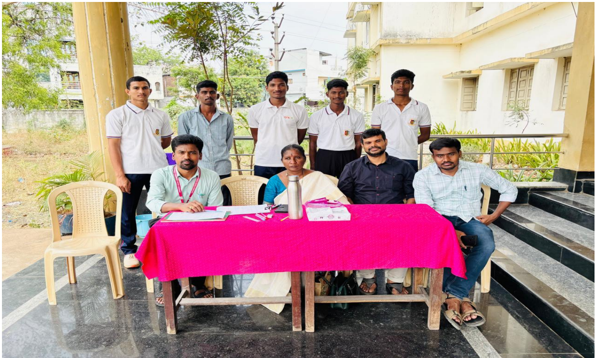
MONITORING OF REGISTRATION PROCESS BY JKC COMMITTEE MEMBERS